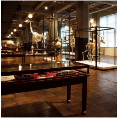
Museography © UMUT works